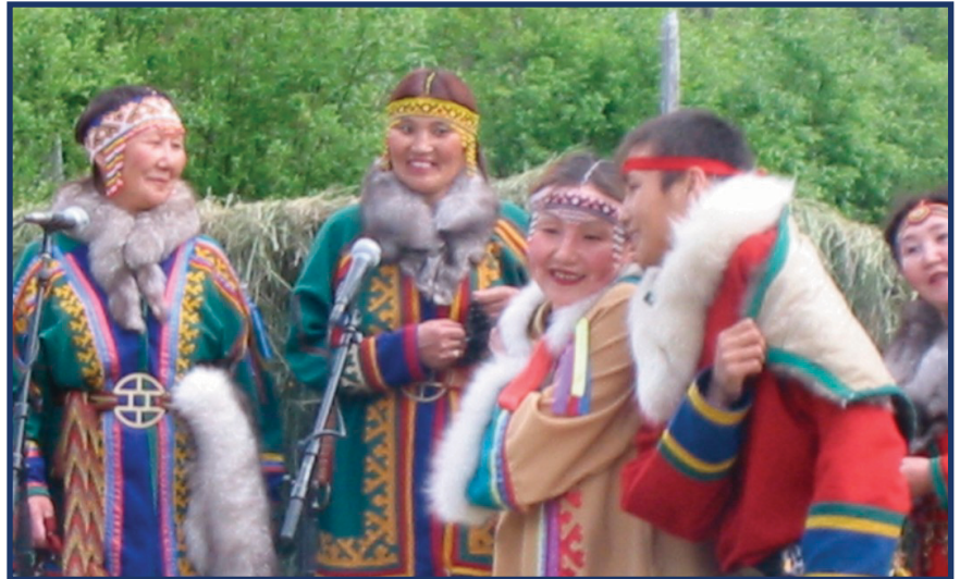
Sami performers at the Riddu Riddu Festival

We travelled to Tromsø, and from there to Riddu Riddu, which is a festival of seventeen years standing organised by the Sami, and celebrates the arts of indigenous peoples of the world – Navajo hoop dancers; Nenet singers; Sami joikers; Mongolian throat singers and Taiwanese musicians. Lavu tents with reindeer skins