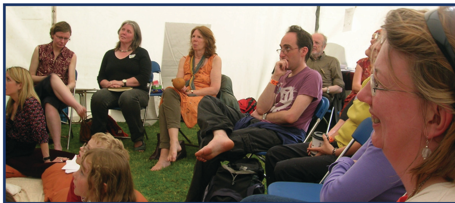
Big Tent Festival-goers in the Lapidus Tent