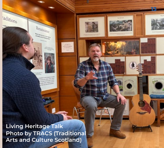
Living Heritage Talk

10am–1:30pm | Living Heritage Fayre 10:30am–1:30pm | Come & Try Sessions 2pm–3:30pm | An Afternoon with Michael Fortune of folklore.ie 4pm–6pm | TRACS House Cèilidh