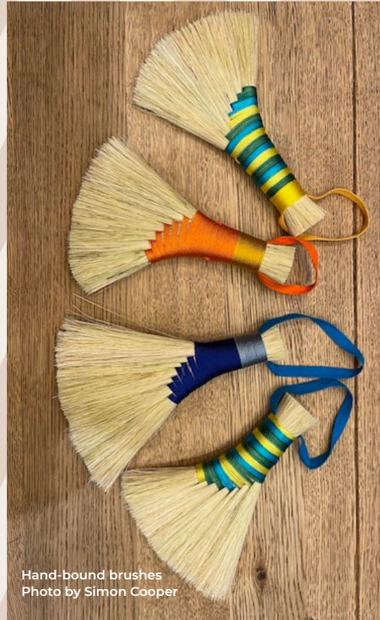
Hand-bound brushes