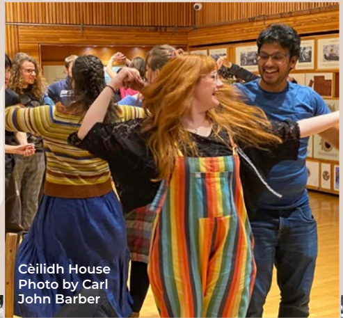
Cèilidh House