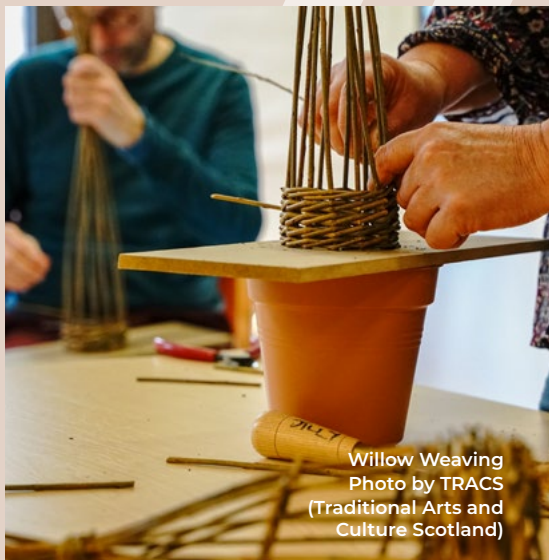
Willow Weaving